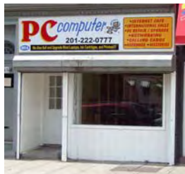
PC Computer 465-A Central Avenue (201) 222-0777