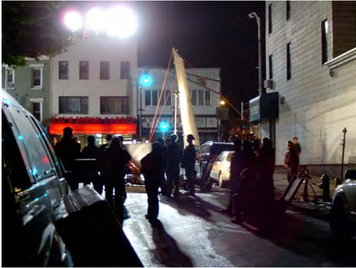
Above: “The Sopranos” film crew spent a very busy night perfecting a scene from season six at the intersection of Congress Street and Central Avenue.

Although Jersey City is arguably New Jersey’s largest city, excitement like this is new in the Heights section. The Jersey City Heights, after all, is known for its quiet, small town, urban village character. Many unsuspecting local residents were surprised to find an assortment of large movie trailers and equipment in the one block radius of Congress Street and Central Avenue. In as inconspicuous a way as you can be with a staff of more than 125 people, the crew worked with Jersey City officials to keep the event low key, thus minimizing disturbance to the surrounding community. The film crew spent an infamous Friday the 13 th setting up for a night scene without incident. Filming did not start until 8 PM and continued until 5 AM the next morning. Jerry “Hesh” Adler was one of the more identifiable actors in the scene.