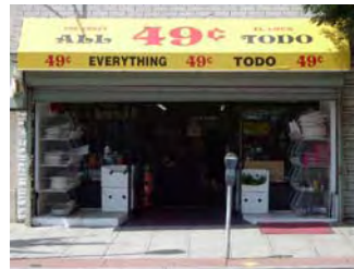
Everything 49 cents 435 Central Avenue (201) 610-1559