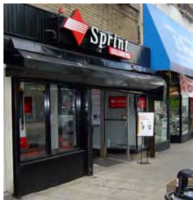
Sprint Exclusive PCS 322 Central Avenue (201) 659-5100

The Central Avenue SID would like to extend a warm welcome to these new businesses in our community.