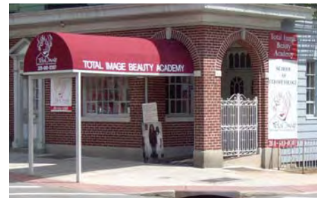
Total Image Beauty Academy 288 Central Avenue (201) 610-0307