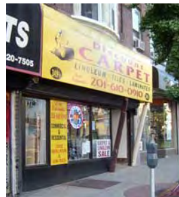
Discount Carpet 349.5 Central Avenue (201) 610-0910