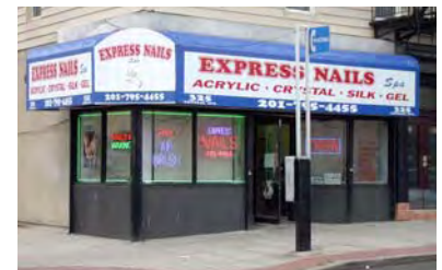
Express Nails 325 Central Avenue (201) 795-4455